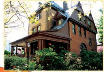
Hessel Hall Office of Admission